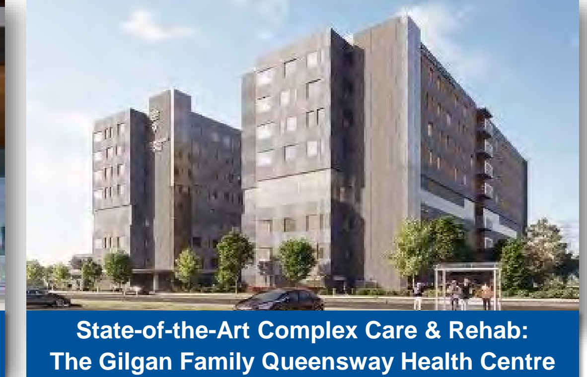
Generational Economic Impacts for Mississauga